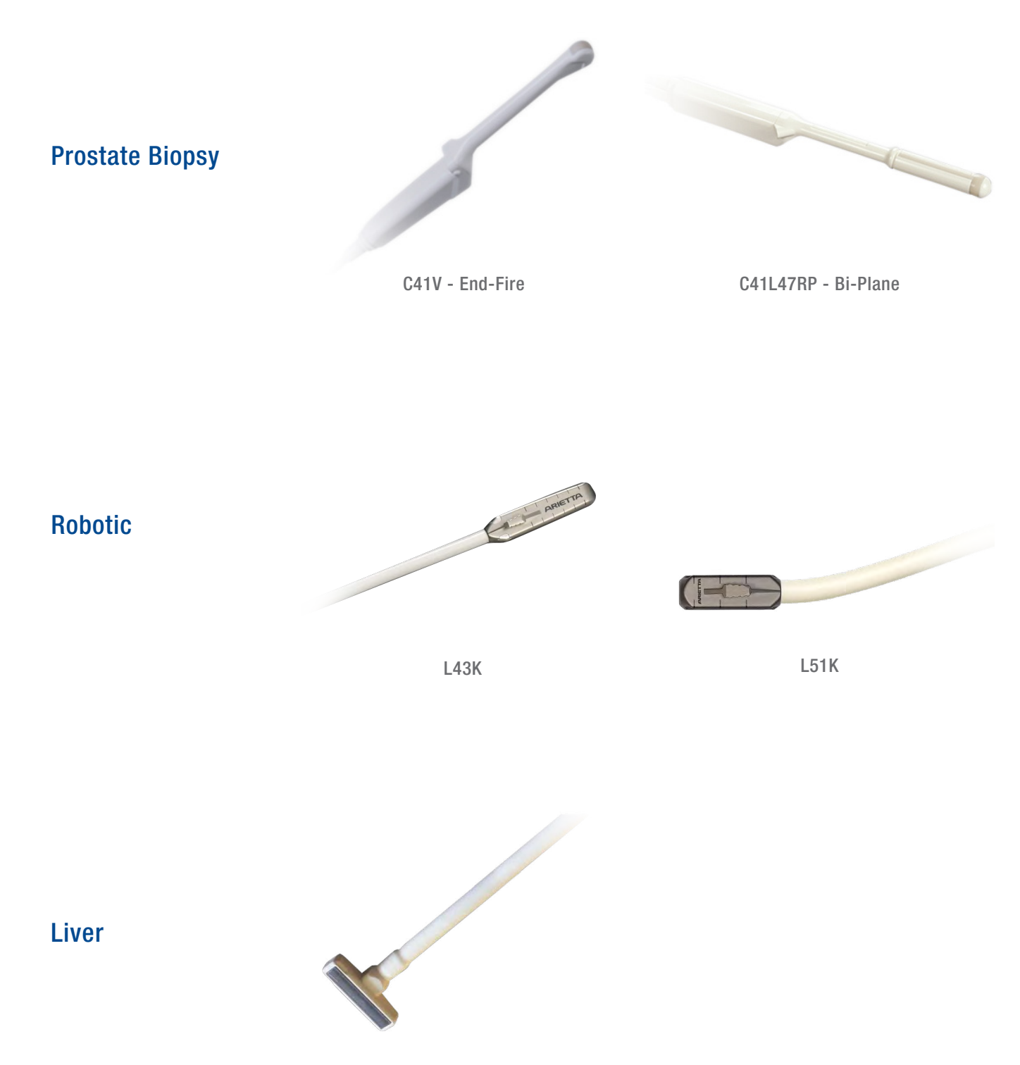
L44K Narrow - View Side-Fire

The Arietta system features several probes for different applications. Two probes are available for prostate biopsies performed either transrectally or transperineally. Two probes are available for robotic applications and one probe is available for liver procedures.