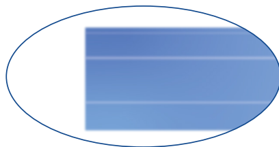
A competitor's traditional flat tip fiber